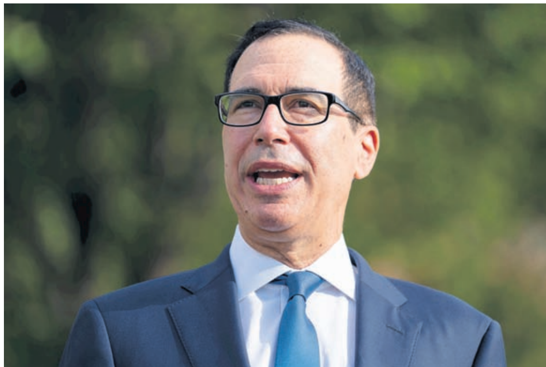
Treasury Secretary Steven Mnuchin speaks with reporters about the coronavirus relief package negotiations, at the White House, Thursday, July 23, 2020, in Washington.

Mnuchin's optimistic assessment came before Democrats weighed in publicly on the updated proposal,